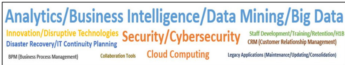
Figure 2: Information Technologies that Should Receive More Investment

n = most senior IT leader in 793 unique organizations