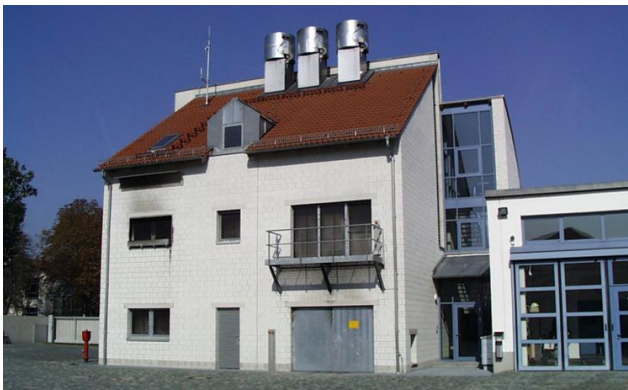
Figure 3. Fire training building (cf. http://www.sfs-w.de )

The experimental scenario was developed in a roundtable session with instructors of the firefighting academy in late 2017. A squad of firefighters will respond to a simulated apartment fire on the second floor of a multi-level building. The building will be represented by the fire training building of the academy (cf. Figure 3). The building emulates a typical residential building with multiple apartments. With remotely controlled gas-fires and fog machines simulating smoke inside the building, the scenario will be designed like a real-world apartment fire. As the task, we selected the search and rescue of a missing person (represented by a dummy) from the apartment. For our experiment, the responding squads will consist of one squad leader and a team of two firefighters. The squad leader commands the task. (S)he will first explore the incident site and then brief the team. The team will be ordered to enter the building, search, and rescue the dummy from a certain room inside the building. Other members that are part of a real-world squad (e.g. the operator of the fire engine) will not be considered in the experiment, which constitutes the virtually only unrealistic element of our experiment.