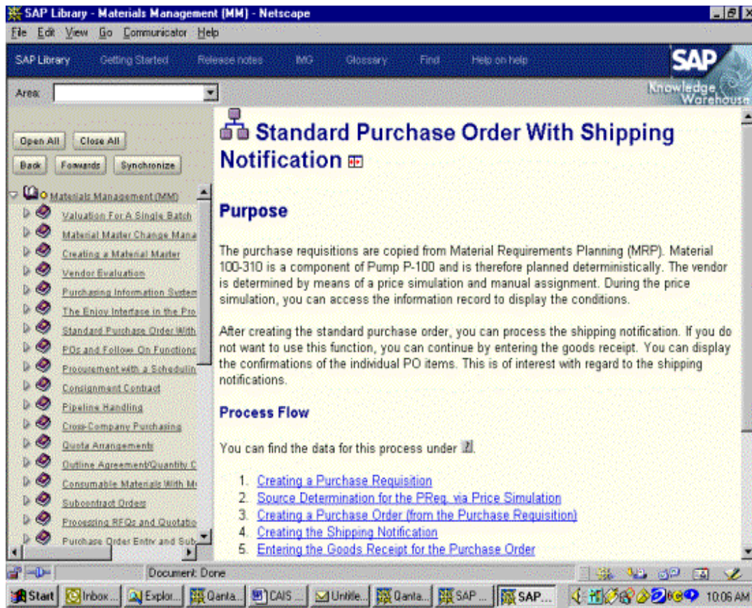
Figure 2. Example of a Business Process description from SAP's IDES