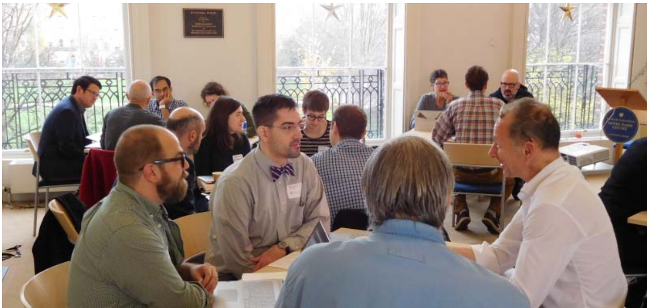
Figure A2. Table Discussion after Each Presentation for Discussing and Collecting Questions 2