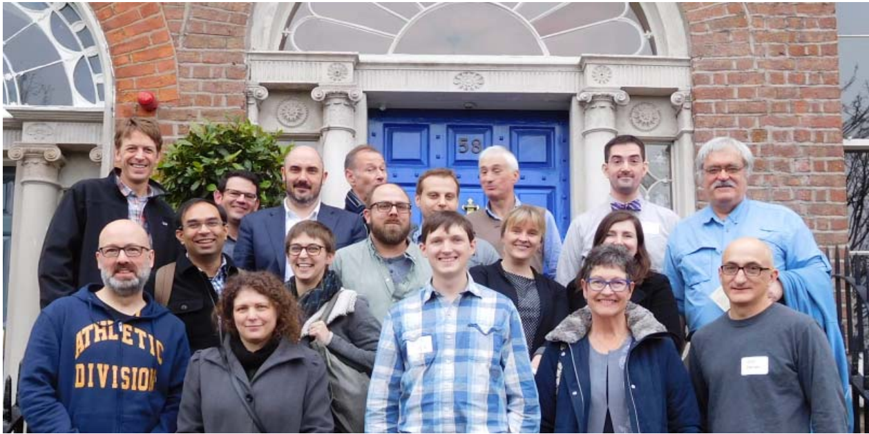
Figure A1. Group Photo of Most Workshop Participants in Front of the O'Connell House 1

Pictures are an essential part of any workshop report.