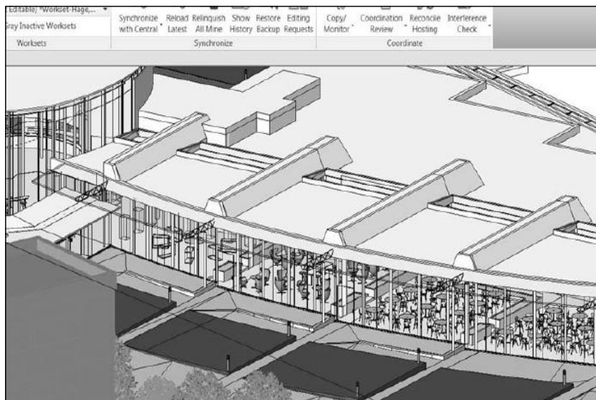
b) Architectural model view