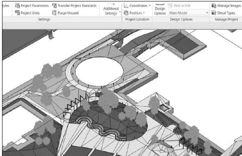
a) Landscape architecture model view

modeling in the AEC industry [Fischer and Kunz, 2004]. Virtual design requires changes in the AEC industry's daily practices. The practical creation of common virtual building models requires a joint effort and close collaboration by all parties providing design to the construction project. In contrast to traditional construction design, in virtual design each party prepares their contribution to a common building model in the form of a specialist model covering their area of expertise. The architect creates a model signifying the shape and outer appearance of the building; the structural engineer creates the structural design model; the heating, ventilation, and air conditioning designer (HVAC) contributes a model on building systems; and so forth. These specialist models need to be joined into a central model of the building aligning all its components. This design practice and its underlying logic of co-creation requires effective handling and timely sharing of information amongst all the diverse parties involved in the project. To illustrate the different foci of subject matter experts in modeling, Figure 1 contrasts a landscape architect's specialist view (upper) versus an architectural view (bottom) of the same building. The landscape architect's model is solely concerned with the outdoor facilities, whereas the architectural model is concerned with the building's shape.