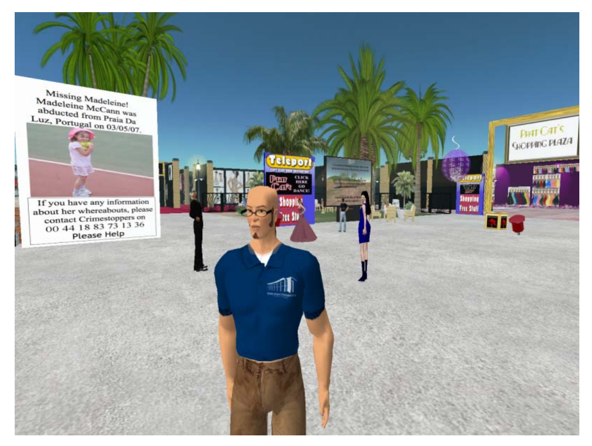
Figure 1. A Business District in Second Life

Second Life, as the most popular social game, was built with the goal of enabling participants to socialize, build local and regional environments, and engage in an in-world virtual economy that revolves around the purchase and sale of user-created content (see Figure 1). We consider Second Life and similar economically driven games to be in a category by themselves, which we label Massively Multiplayer Online Economic Games (i.e., MMOEGs). Regardless of the focus of any particular game, what is common to the MMOEG environment is the fact that economies have arisen inside the game. These economies revolve around virtual objects that participants have created, built, and maintained exclusively within the game environment. A Second Life participant can build a virtual object like a motorcycle, sell it to another participant using the currency of the game, Linden dollars, and spend these earnings on a new virtual outfit for his or her in-game persona (i.e., his or her avatar).