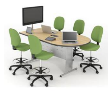
Figure 1: Illustration of a Pod in the Active Learning Classroom

Encouraged by the results of the prior study, we decided to extend TTCL by incorporating a technique to increase collaboration between student groups. The concept of swarm intelligence has its origins in the observation of living things, such as birds or insects, combining efforts in a self-organized way to accomplish tasks that none of the individuals could accomplish alone. For example, termites working together are able to build large nests with complex internal architecture that ensures appropriate temperature and atmosphere for the colony (Garnier, Gautrais, and Theraulaz, 2007). Artificial Intelligence (AI) researchers have created swarm intelligence systems that allow human beings to interact together when making decisions. Such systems have been employed in a variety of contexts including prediction of Oscar winners (Cuthbertson, 2016), identification of biomarkers for lung cancer (Best et al., 2017), and the selection of optimal learning scenarios based on learner's preferences (Kurilovas, Zilinskiene, and Dagiene, 2014). Our implementation of swarm in the TTCL environment attempts to simulate the combination of knowledge on a very small scale. In short, the idea is to make a group of people much smarter as a team than as individuals. In the remainder of this section, we describe our initial implementation of TTCL with swarm and modifications that were made due to circumstances encountered during the semester. Lessons learned and recommendations are also discussed.