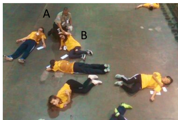
Figure 2: overhead image of paramedic (A), triaging simulated victim (B).

The reliability portion of this study was completed during a Full Scale Exercise (FSE) conducted by the University of Massachusetts Medical Center in collaboration with numerous local first response and emergency preparedness collaborators in Worcester, MA in September 2016. Community volunteers were recruited, consented and moulaged to reflect various injuries including gunshot wounds, abrasions, and lacerations. Forty-four “victims” were assigned to this research protocol and victim injury patterns were chosen to simulate a mass shooter incident at a concert and represented various levels of injury (Figure 2).