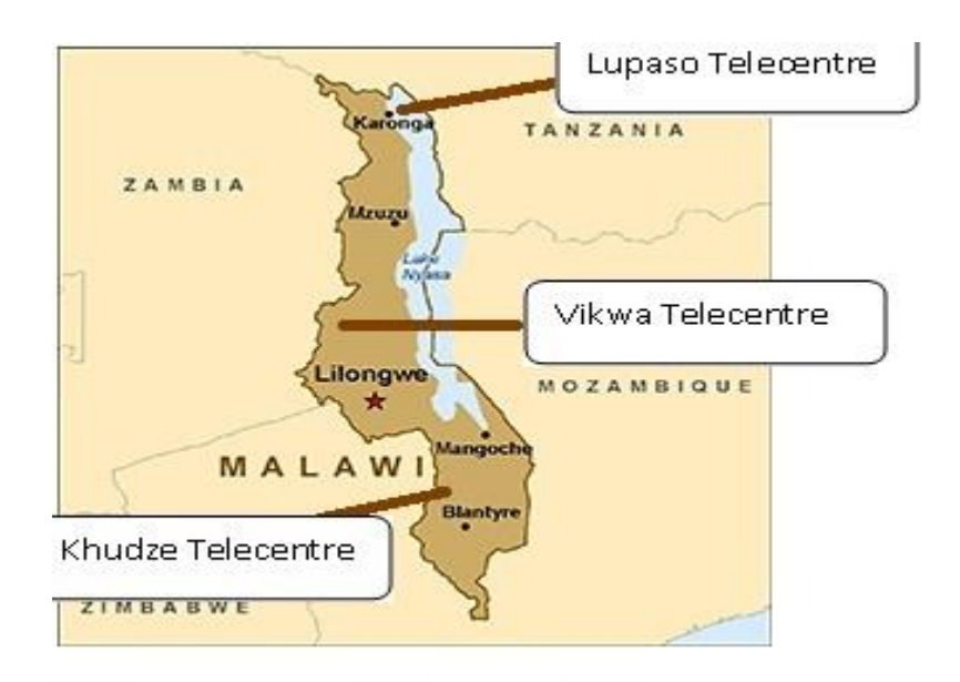
Figure 1: Map of Malawi showing location of telecentres

Figure 1 shows the location of the telecentres on a map of Malawi.