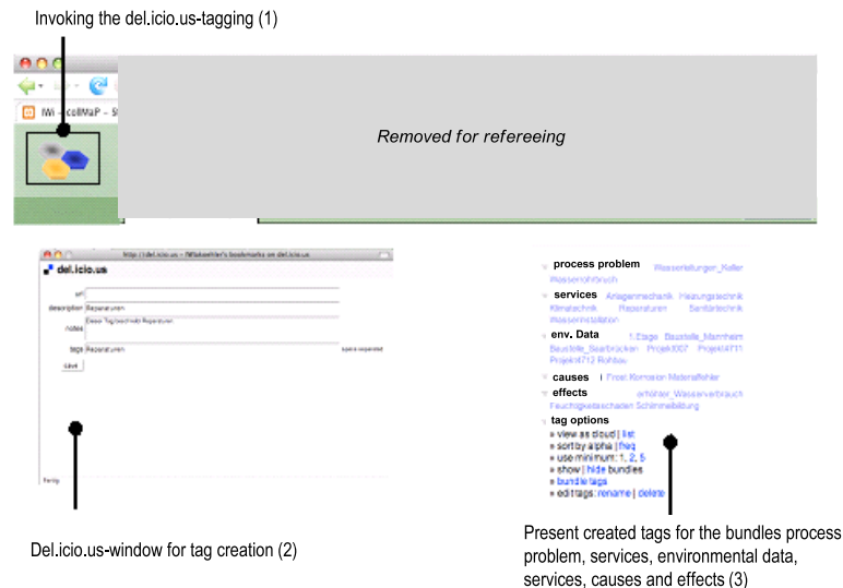
Figure 3: Prototypical implementation of tagging functionality (screenshot)

For the developed prototype it is assumed that the required process models are documented and made available through a publishing function at the modelling platform, bearing in mind, that specific business like tasks need only to be named, without being thoroughly modelled. The tasks described on the single HTML web pages are available and readable for social bookmarking applications. Figure 3 shows the user interface of the realized modeling platform. By opening of the tagging modus a pop-up window of the Delicious web application shows up, in which a user can create new tags. The newly specified tags are then available to the process collective. They can now be utilized for the characterization of models on the modelling platform.