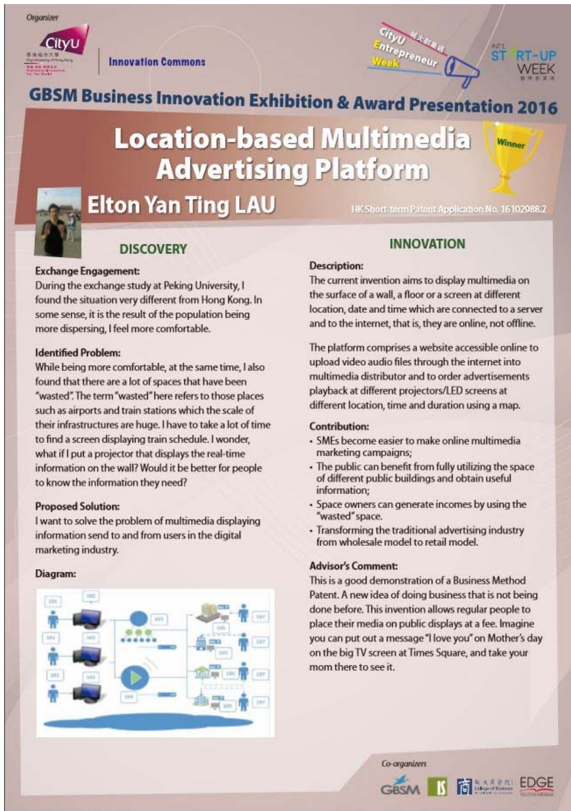
Figure B1. A Poster Sample of the Filed Patent