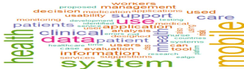
Figure 2 Frequently occurring words in articles under review

A word cloud of frequently occurring words is shown in figure 2, where the size of the word reflects its frequency of occurrence. As can be seen, mobile, health, system, data, use, clinical, care, mHealth, support and patient are some of the most frequently occurring words.