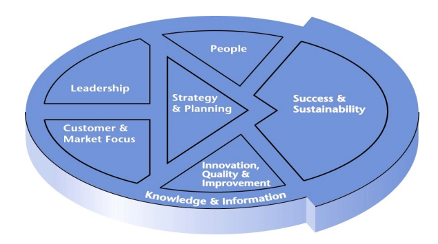
Fig. 2 Australian Business Excellence Framework

The theoretical model underlying this study links Business Excellence principles with KM practices, and denotes how KM success factors that are informed by principles of business excellence can lead to IP (see Fig. 3).