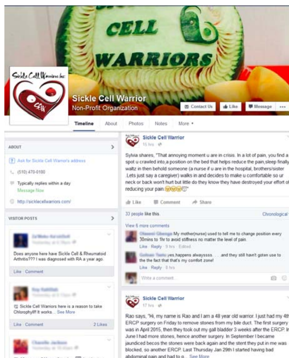
Figure 1 - Sickle Cell Warriors page on Facebook

patients and their care givers. The popularity among the Sickle Cell patients motivated our studies of these groups. Sickle-Cell warriors [9] was started in May 2005 and is a moderated public Facebook page whose creator and primary owner is both a registered nurse and a patient living with sickle cell disease. The administrators of the Sickle Cell Warriors support group manage the content and tempers the posts on the page by selecting and highlighting on the page those posts they believe will be the most relevant to other members; however, all of the posts on the page are publicly visible.