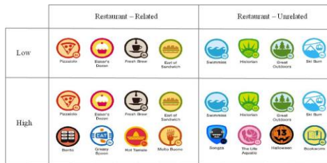
Figure 2. Gamification elements – badges

After reading the review comment and taking a look at the gamification elements this reviewer has earned (depending on the condition group), participants were asked to answer the same three questions discussed in Study 1, which are used to measure the effectiveness of the review comment. Study 2 uses a 2 (category: badges versus mayorships) × 2 (type: restaurant – related versus restaurant – unrelated) × 2 (number: low versus high) between-subjects design. Participants were randomly assignment to one of the eight groups. We keep the review comment consistent in all eight groups and only manipulate the gamification elements’ type and number. Each block in Figure 2 and Figure 3 represents the gamification element that is provided in each of the eight groups besides the review comment.