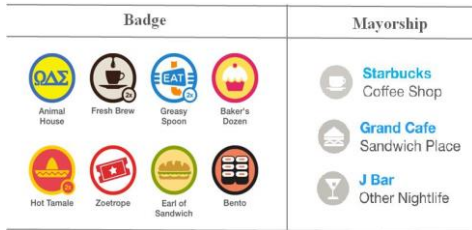
Figure 1. Gamification used in study 1

The three questions mentioned above measured different aspects of the reviewer's perceived effectiveness. On seven-point scales, participants assessed the review comment's usefulness, their recommendation likelihood, and self-acting likelihood. Combining these three measures, we create a composite measure called Effectiveness ( \alpha = 0.82 ) which served as our main dependent variable.