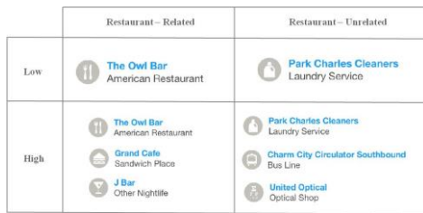
Figure 3. Gamification elements – mayorships