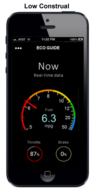
Figure 2. Experimental Stimuli

To develop our experimental stimuli we build upon two of the most common approaches to manipulate construal level. Numerous studies have shown that distant events are represented in a more abstract, structured, high-level manner than near events (Trope and Liberman 2010; Trope et al. 2007). Hence, we decided that the low construal stimulus is presenting real time information, i.e. the stimulus is depicting what is happening now and the high construal stimulus is showing aggregated monthly information, thus also reflecting more distant events. The stimuli are depicted in Figure 2.