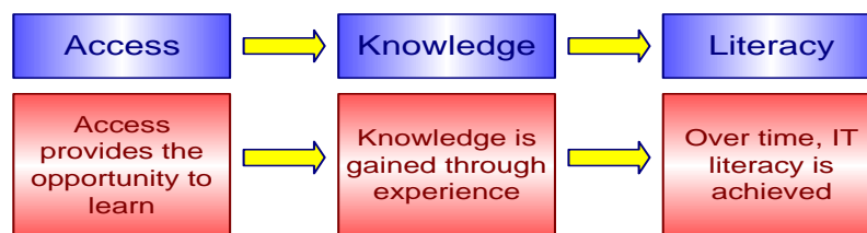
Figure 1 – Path to IT Literacy

As noted earlier, bridging the digital divide requires both access and knowledge. To a large extent, IT literacy requires access to ICT. Without access, there is no opportunity to gain experience and confidence with the use of IT. This is illustrated in Figure 1.