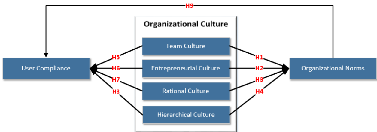
Figure 2. Proposed Research Model

H9: Organizational norms drive users to comply with ISP