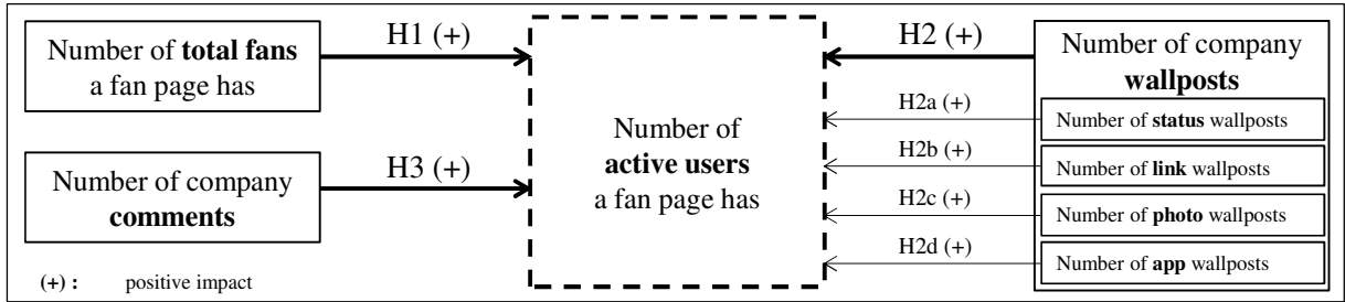
Figure 1 Research Model

Our complete research model is presented in Figure 1 and tested empirically in the following.