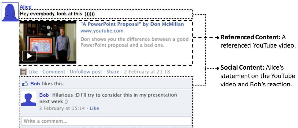
Figure 1. A Facebook newsfeed post can include different content elements. Each content element has an individual type (editorial, referenced or social) and has an individual author.

Figure 1 provides an example of a newsfeed post which is composed of distinct content elements. Each content element is of a particular type and has an individual author.