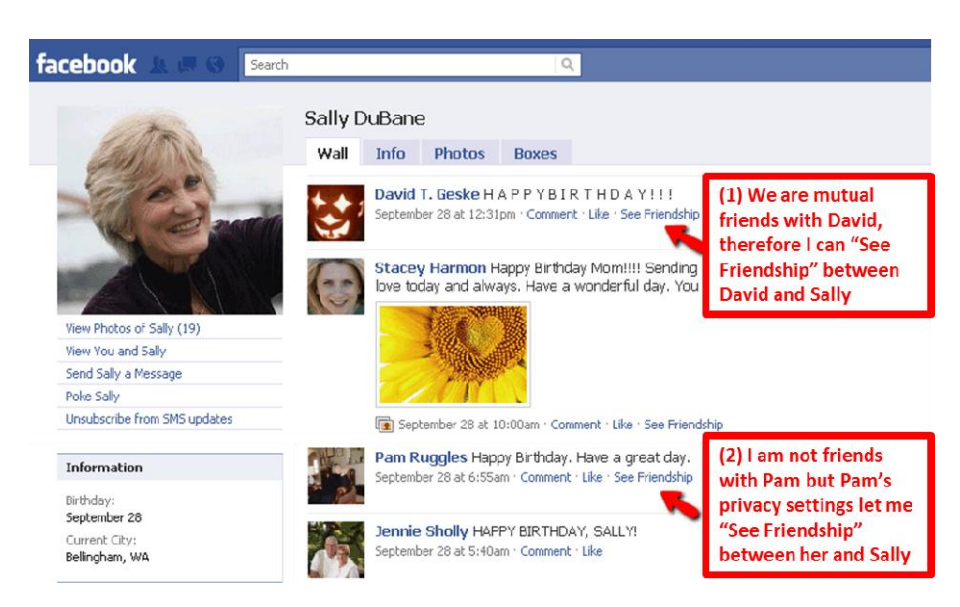
Figure 4: See Friendship UF-UF by Browsing (1), and See Frienship UF-UFF (2) (Adapted from Pixel Coaching, 2010)