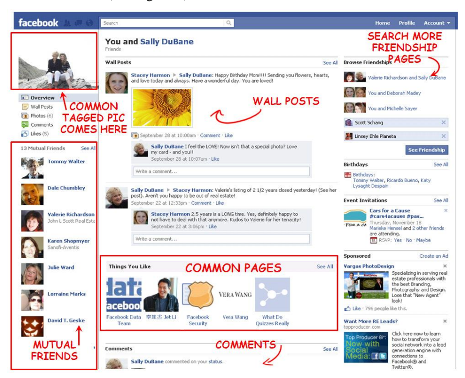
Figure 1: Illustration of a Friendship Page on Facebook (Adapted from Pixel Coaching, 2010)

In Oct 2010, Facebook introduced the Friendship Pages, which chronicled the history of social interactions between two friends including wall conversations, photos with both tagged in, comments they share, events they attended together, things they both like, and mutual friend lists (see Figure 1).