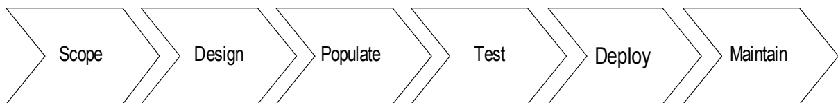
Figure 1 Development Framework for maturity models (Rosemann and deBruin 2005)

For the first stage of this study a literature analysis and content analysis were conducted. The foci of these analyses were the characteristics and potentials of e-Business as well as the various maturity models in different fields. The examination of maturity models proved to be a challenge for researchers as there are a lot of maturity models, most of which are not fully published, not yet finished or poorly documented. The design of our eBIS maturity model follows the framework for the development of maturity models as recommended by ROSEMANN and deBRUIN (2005). The framework includes six successive phases: I Scope, II Design, III Populate, IV Test, V Deploy and VI Maintain (Fig. 1).