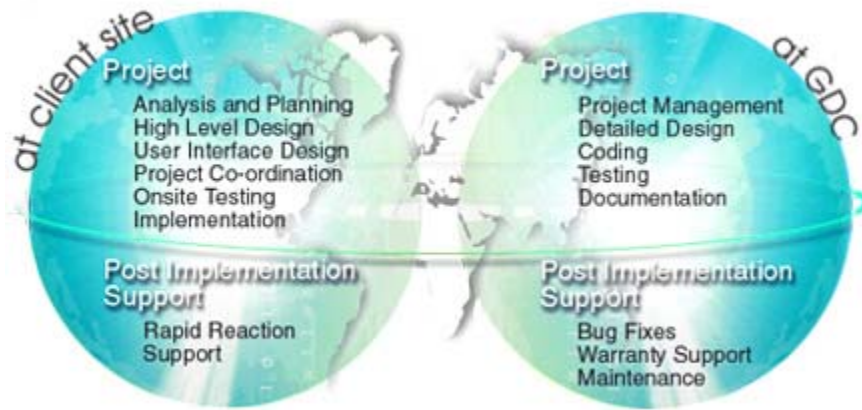
Exhibit 5: Infosys' Global Delivery Model (GDM)