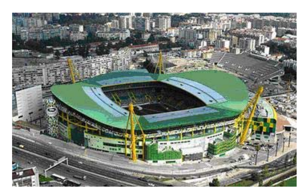
Figure 1. José Alvalade Stadium, Lisbon