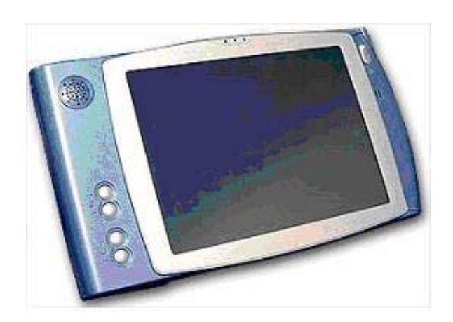
Exhibit 6. FIC Midori Linux AquaPad

The 2.5lb AquaPad is a medium sized portable device centered around an 800x600 pixel TFT touch sensitive screen. The device is larger than a PDA, but smaller than a laptop.