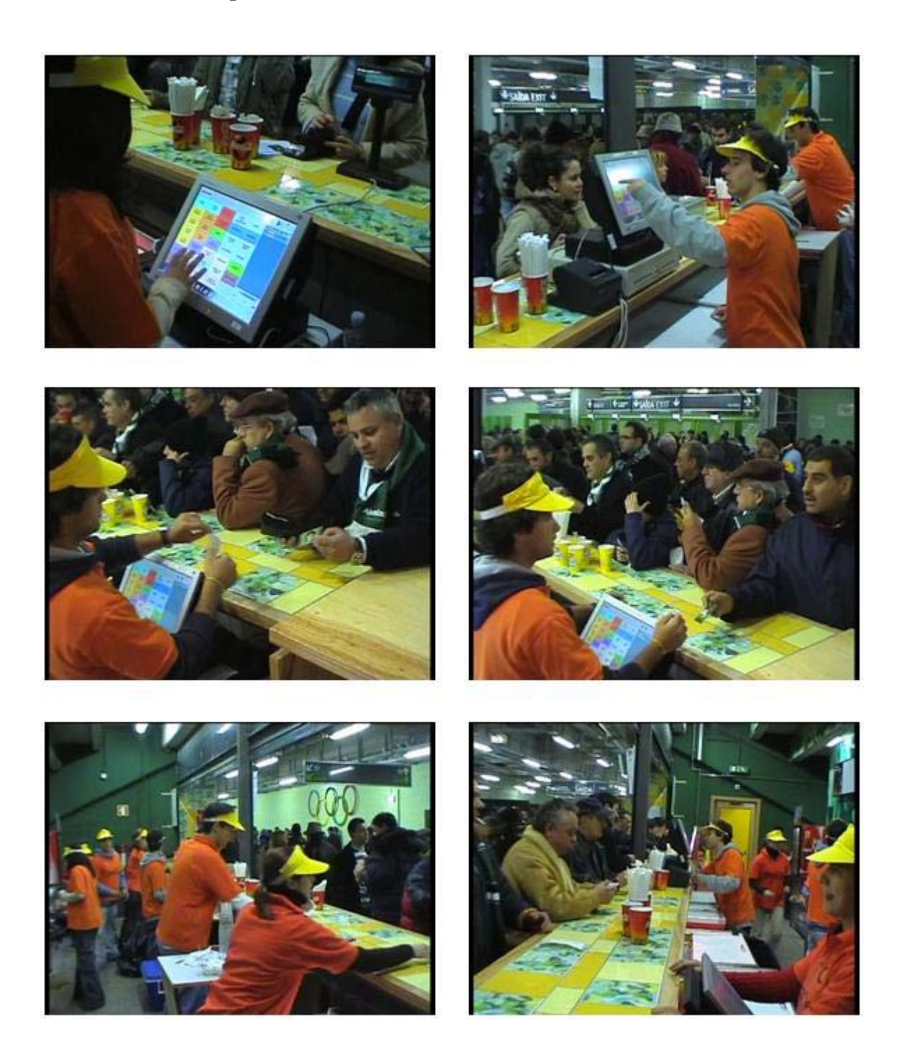
Exhibit 2. Bars in Operation