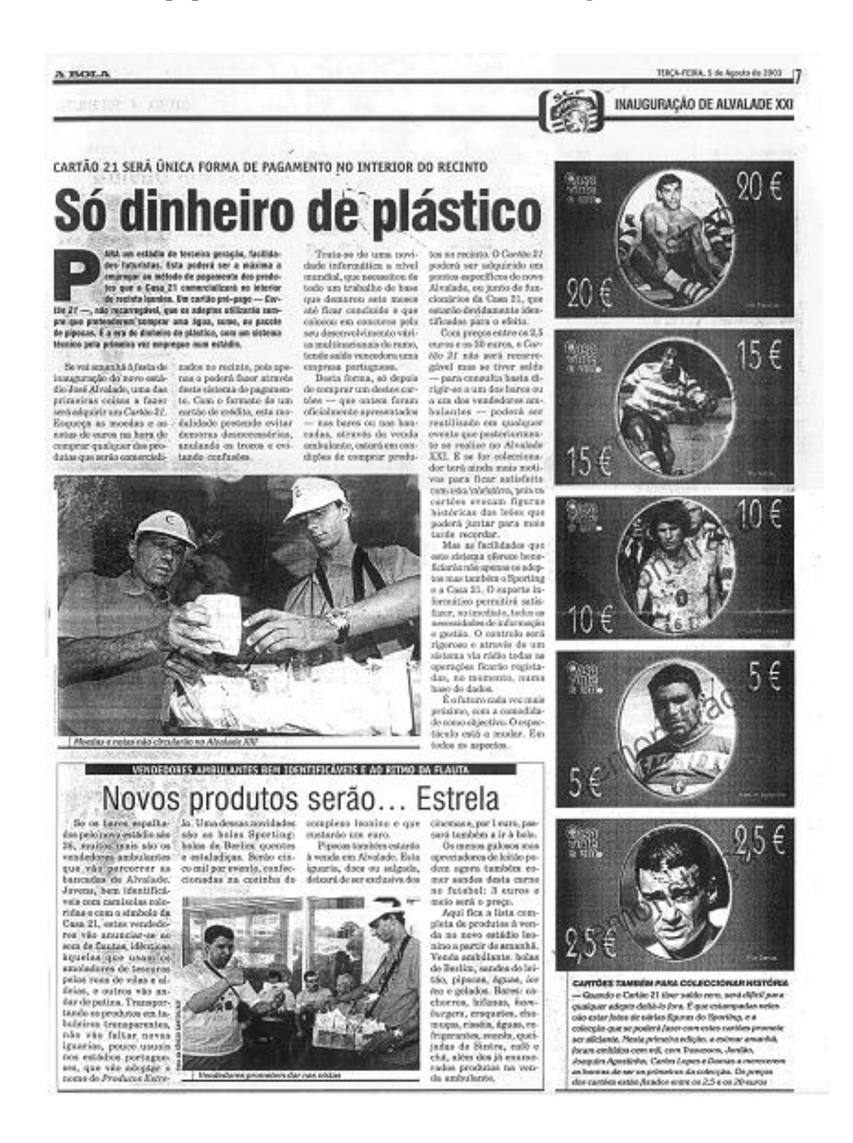
Exhibit 1. Newspaper Article Published before the Inauguration of the Stadium