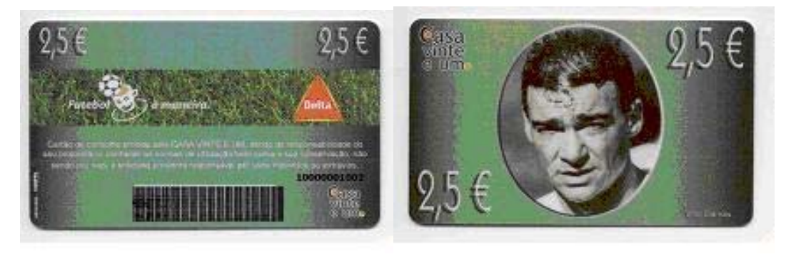
Figure 4: Example of the Early Card Design

The system was meant to avoid the use of cash thereby shortening the time it took to execute payment transactions. For clients, this meant shorter queues at the bars. For Casa XXI, it meant more productivity of their bar personnel, faster turnaround, and more sales at peak times. In addition, it reduced the need for controlling cash registers and bartenders.