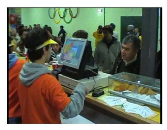
Figure 4. Point-of-Sale (POS) Terminal

The Front Office software supported the work of the sales staff in the restaurants and bars (figure 4). A client wanting to buy an item at a bar, had to go firstly to the bartender at a POS, tell what he/she wanted to order and give his/her Cartão 21. The bartender then clicked the order on the tactile screen and would slide the card through the bar code reader for the payment. Then the POS printed a ticket (receipt/order confirmation) that the client subsequently had to show to collect the ordered item from another staff member (normally in the central section of the bar). Thus, in busy moments, customers had to queue a second time to get the items they had ordered (see exhibit 2).