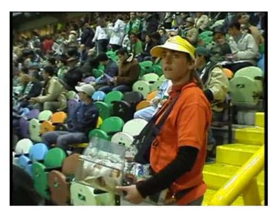
Figure 5. "Vendedor ambulante" or Walking Seller

The Cartão 21 system had been conceived by Casa XXI, but the design and implementation had been subcontracted. Several international IT services companies responded to the call for tender, but the project was awarded to Meag, a Portuguese firm. Meag was a wholesaler of office and computer supplies that had extended its business into computer system installations. Their experience with large systems implementation was, however, limited.