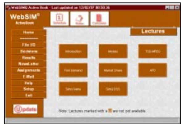
Figure 3. Lectures