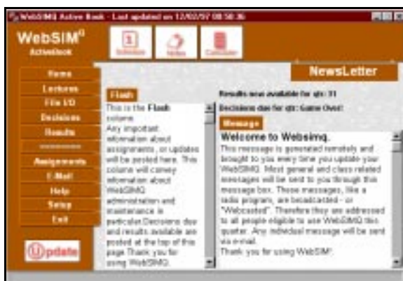
Figure 4. NewsLetter

Class Lectures are accessible from the Lecture screen (Figure 3). The lecture notes can be made in Microsoft PowerPoint®, WordPerfect Presentation®, or any other commercial presentation software. The notes can directly run through the software's slideshow viewer or runtime software as required by the vendor. The slideshow employs a full screen display, with transitioned screens and bullet points that roll out individually with visual cues. This provides full freedom to the instructors in choosing the presentation software of their choice. However, for students it provides a one-point-and-click, guaranteed access to all class lecture notes. If a student does not have the runtime software, the required runtime version can be provided to be downloaded and installed on the local computer through ActiveBook.