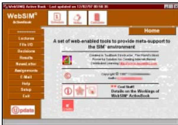
Figure 2. Home Screen

results are specific course requirements. These are handled separately through an add-on module.