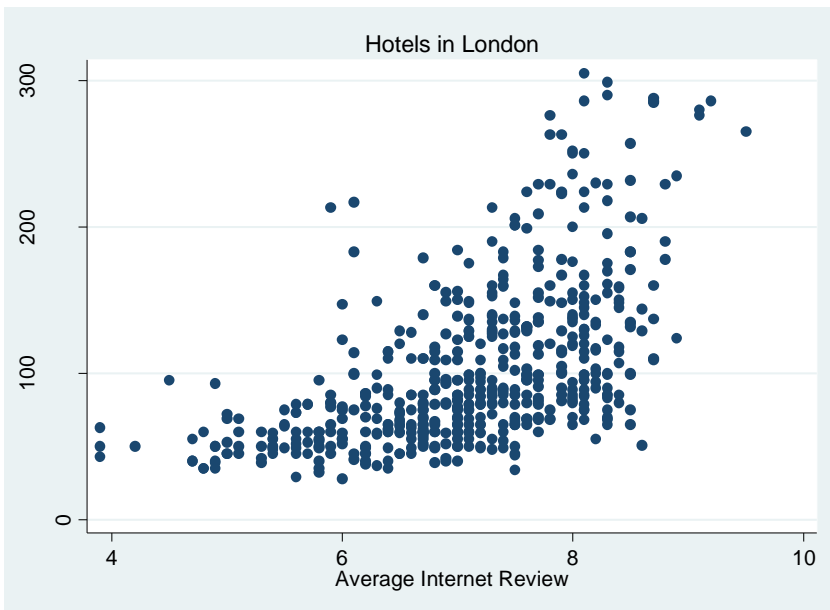
Figure II: Hotel prices and average internet review in London