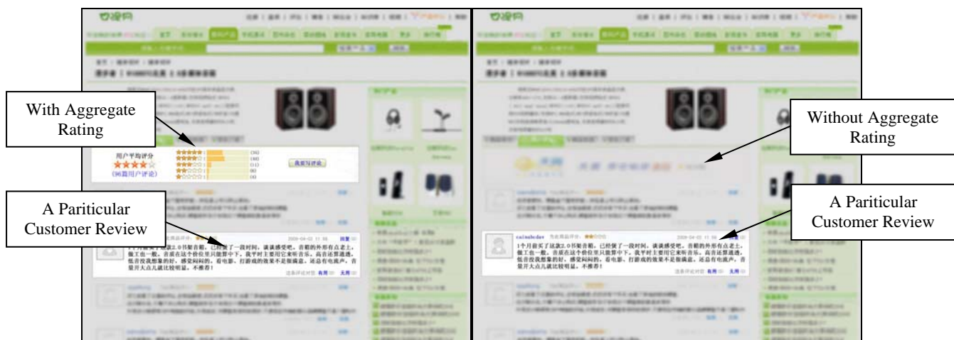
Figure 2: Screenshots of the “With Aggregate Rating” and “Without Aggregate Rating” conditions

Four images were designed as simulated screen captures from a eWOM system. The screen layout of the images was designed to resemble commercial websites. To avoid distractions and possible confounds due to information other than the selected customer review and aggregate rating, such as brand name, price, etc., we intentionally blurred other zones with Adobe Photoshop filter-glass tools so that only one specific customer review and the aggregate information (when applicable) are clearly visible. In the control conditions, the aggregate rating zone was replaced with a blurred banner advertisement so as to keep the layout identical across all conditions (as shown in Figure 2).