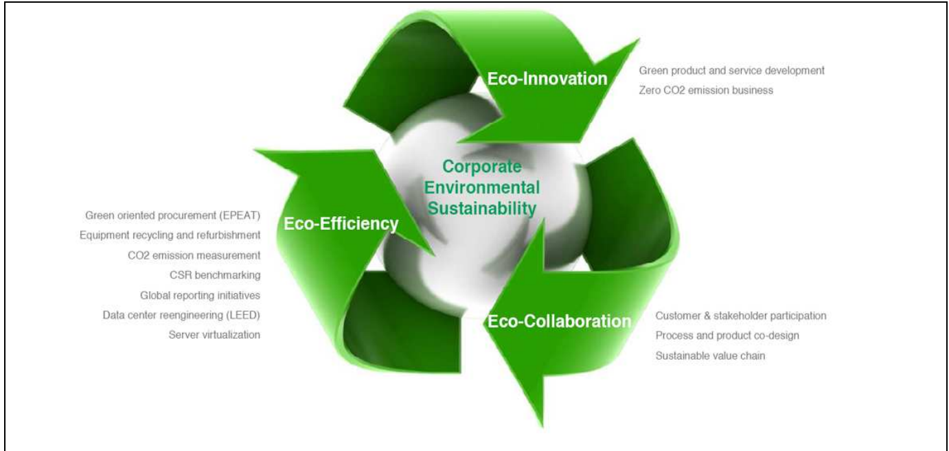
Figure 1. Three-sided Diagram of Green IT in Practitioner Literature

Murugesan's four categories relate to the three-sided diagram from Siggins and Murphy: Green Use and Green Disposal relate to Eco-Efficiency, Green Design relates to Eco-Collaboration, and Green Manufacturing relates to Eco-Innovation. Therefore, these three factors are discussed throughout the practitioner literature, and Table 2 shows this breakdown.