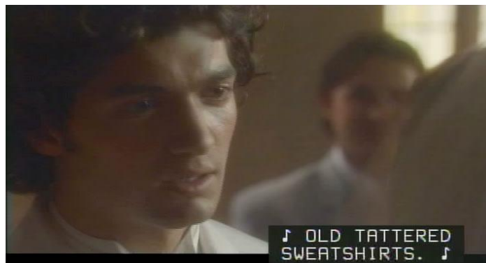
Figure 3: Conventional captions