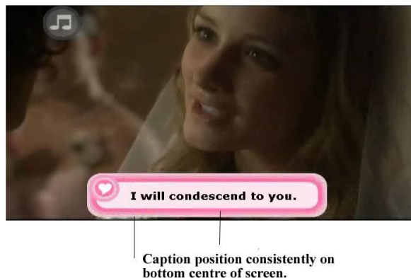
Figure 1: Dynamic emotive captions for Traffic Jammed