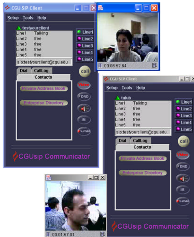
Figure 3. Snapshot of CGUsipClientv1.1 while on a call.

As part of Internet2 Middleware program, our group is primarily responsible for developing the necessary middleware that will provide security services for large-scale video-conferencing systems. Since both SIP and H.323 protocols have become dominant signaling standards for voice and video over the Internet, we are building actual clients that will have the above discussed authentication and authorization mechanisms. The use of SAML assertions to create a federated identity management system is expected to scale very well. This article has described the high-level challenges we are facing for implementing a federated security middleware and the of how we are implementing such systems. Future articles will report on the case study and performance aspects of these systems as they get widely adopted by higher educational institutions for campus-wide video-conferencing.