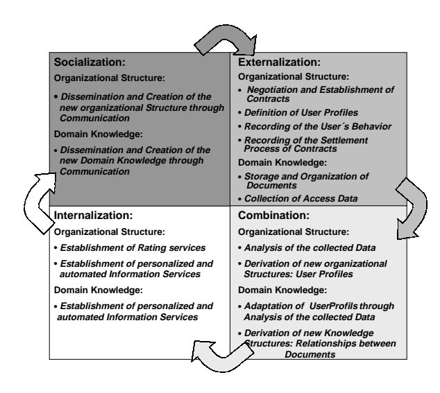
Figure 3 The phases of the media spiral

Another organizational dimension, being rather independent of the bureaucratic structures and important for the establishment of and work within a task force reflect the interests and capabilities of an individual. This dimension can be reconstructed by establishing user profiles. "Contracts" with information services can be set up using this profile information to support the knowledge creation process. This corresponds to a pre-defined personalization of the system, where the human agent takes over the configuration. The profile information about the capabilities and interests can furthermore be used to establish information services supporting the establishment of task forces itself (see also combination and internalization).