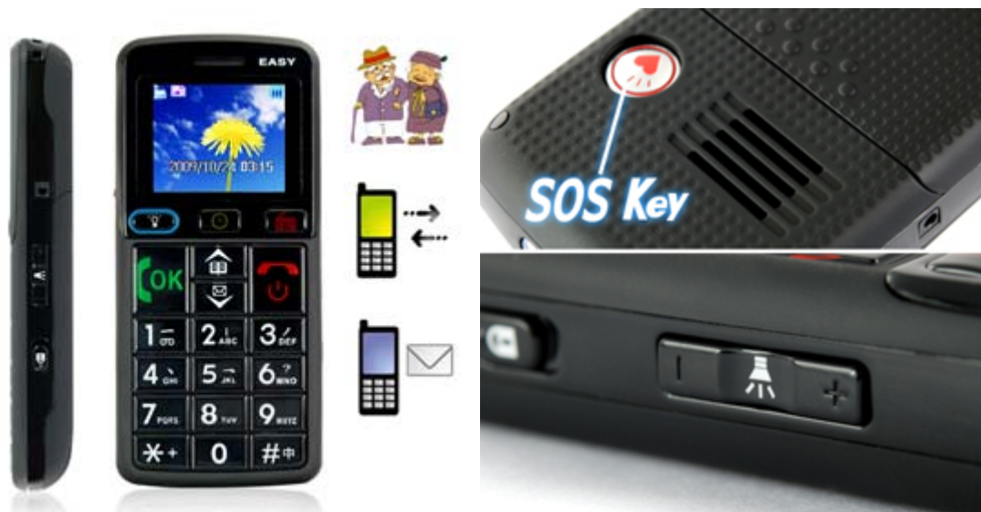
Figure 1: Senior citizen mobile phone

Many commercial vendors are becoming aware of the importance of the senior market and indeed there are a number of commercial solutions provided for senior citizens. For example, the following phone is specially designed for senior citizens with considerations of a senior-friendly user-interface (big button, simple operations), alarm features and emergency contact.