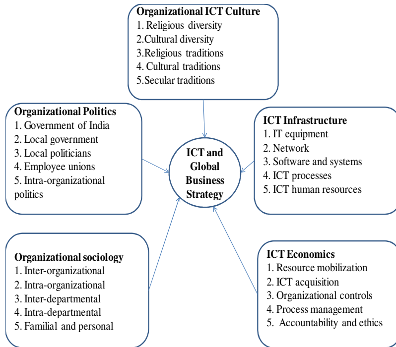
Figure 1: Dimensions of ICT Phenomenology

aforementioned 93 respondents were then asked to indicate the perceived level of importance of each category by selecting a choice on a four-point Likert-type scale indicating 1=somewhat important, 2=important, 3=very important, and 4=extremely important. Since the importance of these factors in ICT implementation is widely accepted, as explained later in the section on Analysis and Interpretation, a five point dichotomous Likert scale was considered unnecessary for ranking the variables. Table 2 contains the aggregated results of the survey for the sake of brevity.