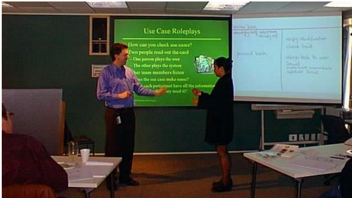
Figure 2: A team performing use case roleplay while others review the dialog.

We then select a card and begin to work out the dialogue. We select people for the roles of user and system, and use an exploratory kind of roleplay rehearsal. The team works together on determining the steps in the dialogue. When ideas seem reasonable, the roleplayers “play-act” through the script, as shown in figure 2. The rest of the team audit, and afterwards the dialogue is discussed and improved where necessary. Increasing availability of document cameras means cards can easily be projected on a large screen for larger groups to follow. This process is applied iteratively until the team is satisfied the dialogue represents the way the user and the system should interact. Sometimes it helps to leave one use case and work with another, returning later to improve the earlier one.