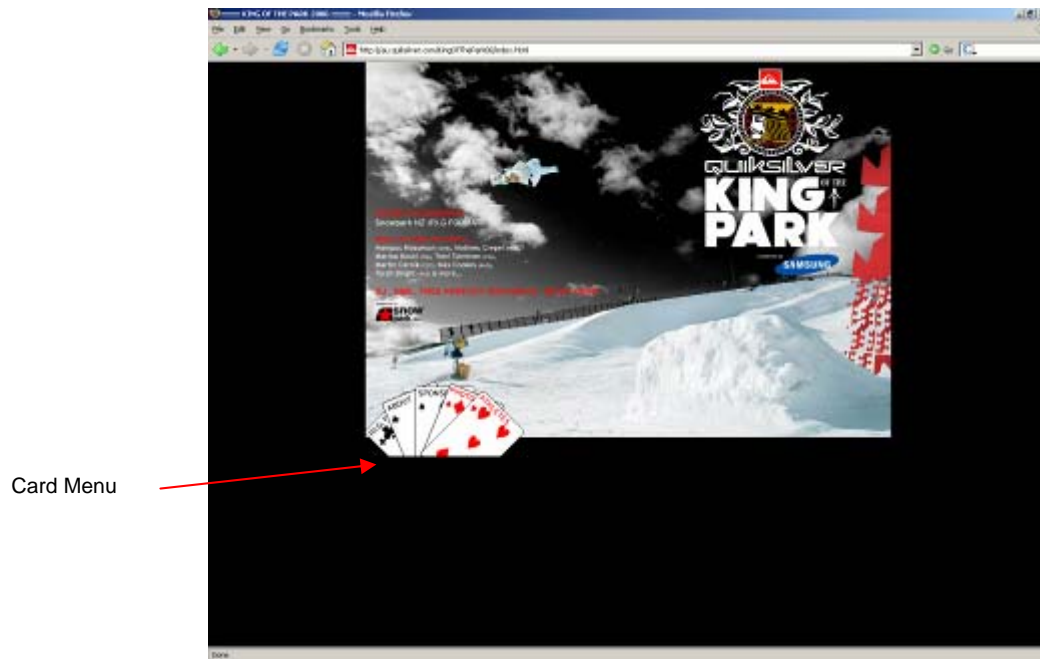
Figure 2: Quiksilver's King of the Park 06 web page