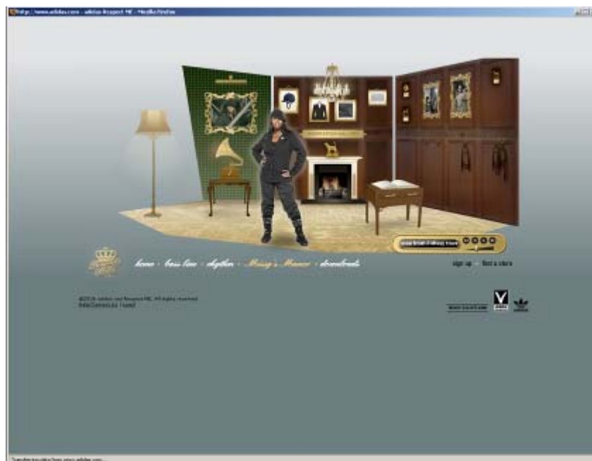
Figure 3: Adidas Heritage's Missy's Manor page