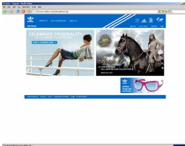
Figure 5: Home page of Adidas Heritage (assessed 23 rd November 2006)

Adidas is a German sport apparel manufacturer and is the second largest footwear manufacturer worldwide (Wikipedia 2006a). Adidas's mission is to be 'the leading sports brand in the world' (Adidas Group 2006) and provides three main clothing lines that are targeted at different groups of consumers: 'Sports Performance' is targeted at athletes who requires products that can meet high performance levels; 'Sports Heritage' is designed for trendsetters interested at street or authentic style products; and 'Sports Style' is aimed at consumers who desire stylish and fashion-oriented sportswear products. This research only focuses on the product line of Sport Heritage.