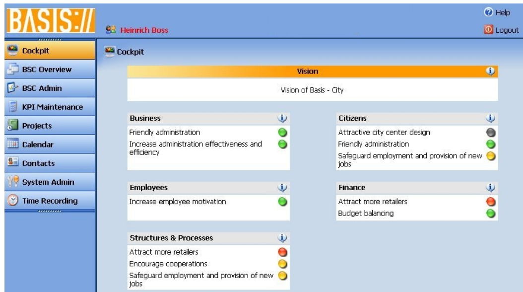
Figure 3: BASIS cockpit

tool for this purpose was not feasible and therefore applying OSS became the favoured solution. Furthermore, the existing information system environment consisted of a heterogeneous pool of autarkic applications hardly interconnected.