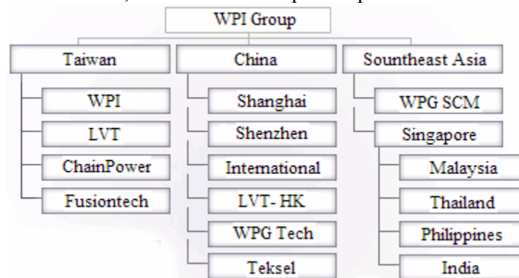
Figure 2. WPI-Group Service Network

The WPI-Group now has regional service networks in Taiwan, China, and Southeast Asia (figure 2-2). Each subsidiary has a focus market. For example, ChainPower specializes in wireless communication and Bluetooth technology, while Teksel can satisfy Japanese customers in Asia with its staff, all of which can speak Japanese.