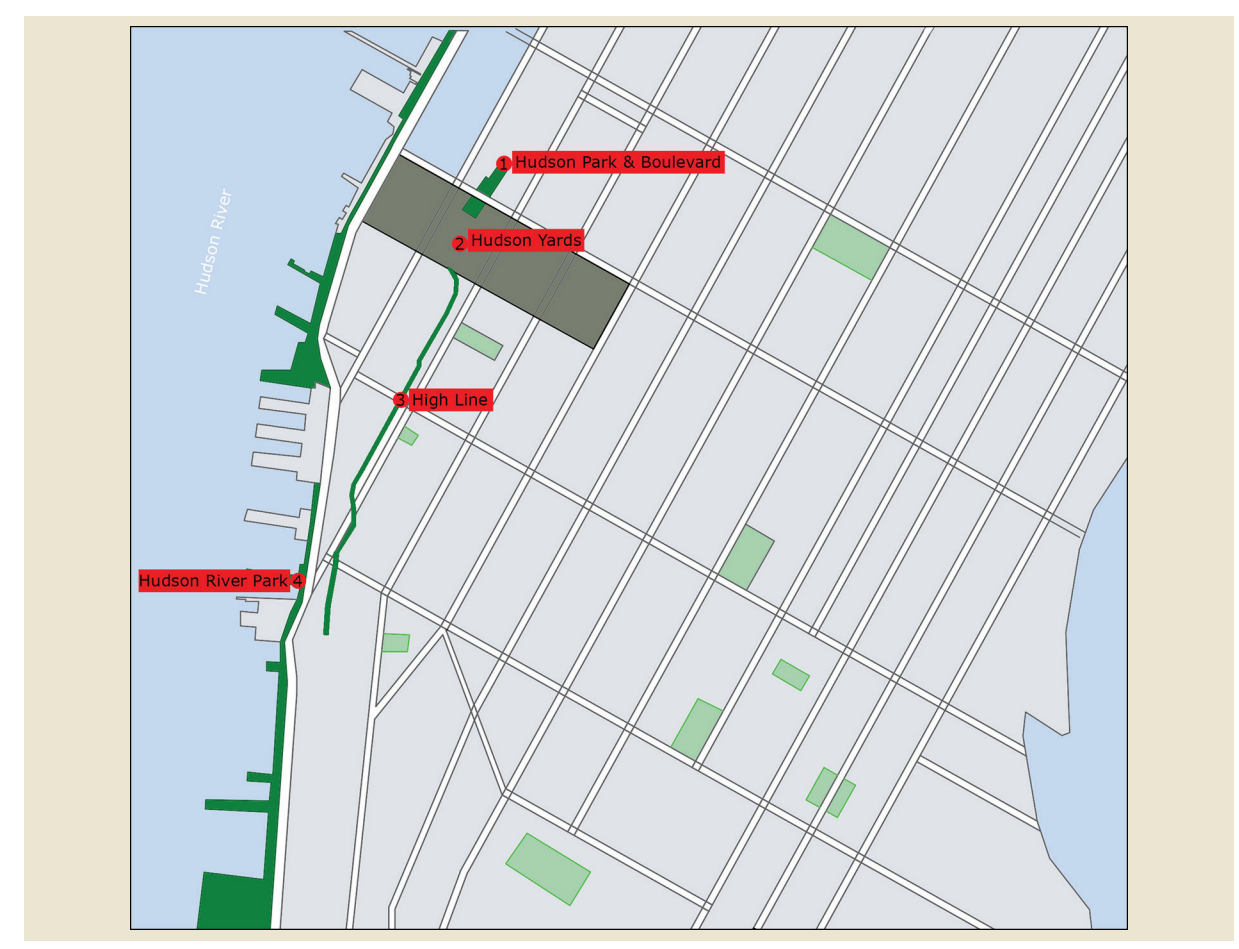
Fig.5: Map of New York City with Hudson Yards as the converging point of the three parks.

innovative space to Piazza San Marco in Venice or Piazza San Pietro in Rome. These squares have both entered the collective imagination for their architecture and a greater symbolism with incomparable characteristics to others and making them unique in their genres. Likewise, the Hudson Public Square and Gardens want to become the representative of, and the driving force for the new century in the requalification of spaces with a great potential to connect to the urban pattern in a sustainable key.<sup>1</sup>