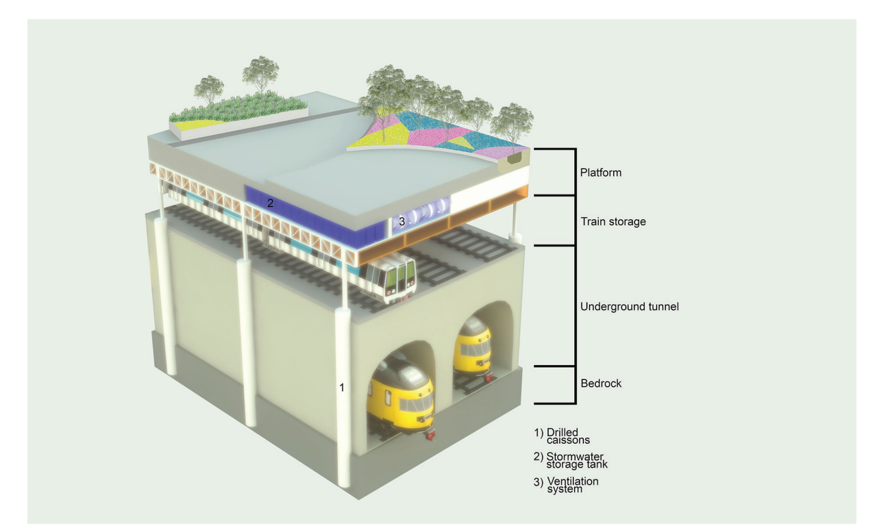
Fig.4: Platform below Hudson Yards. Source: scheme by Barbara di Vico.

Alongside the High Line, another park is under construction between the tall towers, that can be also considered an elevated park due to its position over rail tracks, and where technology will allow to create a space suitable for the growth of 28,000 herbaceous plants and more than 200 trees (fig.4). The Public Square and Gardens is a five-acre space of lush greenery and cultural expression, designed by the firm of Nelson Byrd Woltz. The problem caused by the heat generated by train represented a challenge to create a system for the growth of plants. A ventilation system powered by 15 fans commonly found in jet engines will supply fresh air to the track level. Besides, due to the presence of rail tracks, there is a minimum soil depth of 4 feet for trees and 18 inches for other plants, that would keep them from growing well. To protect plants' roots, a layered soil, presented to the community as "the smartest soil in town", made of sand and gravel between two concrete slabs, will provide for soil aeration, irrigation, drainage and ongoing control of nutrients, allowing roots to run wide if not deep. Moreover, the heat from the train yard below can reach up to 150 degrees; therefore, a network of tubing is being embedded within the concrete slab to circulate cooling liquids