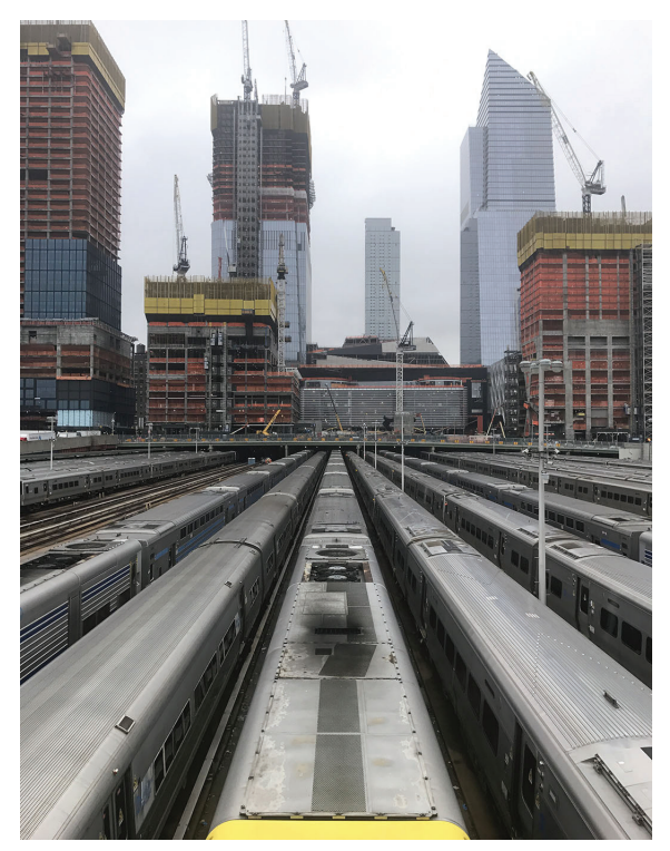
Fig.2: Commuter rail trains below the platform and view of the construction site for Hudson Yards.

friendly neighbourhood in New York with ongoing optimization for safety and comfort.