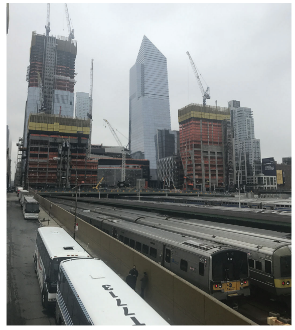
Fig.3: View of the construction site from the High Line.