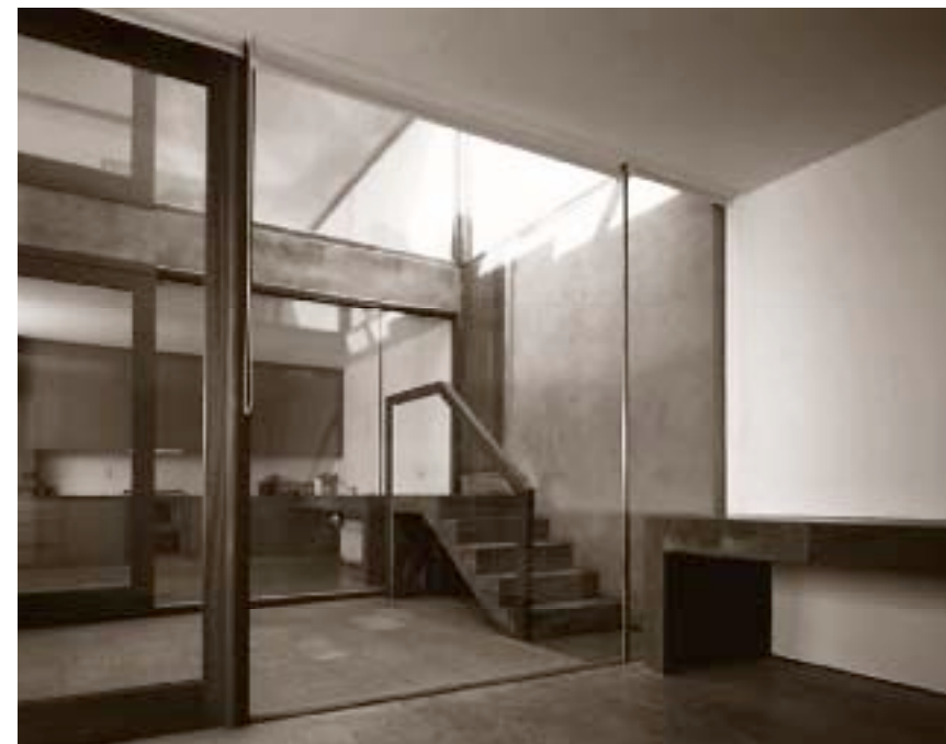
Clockwise from top left: