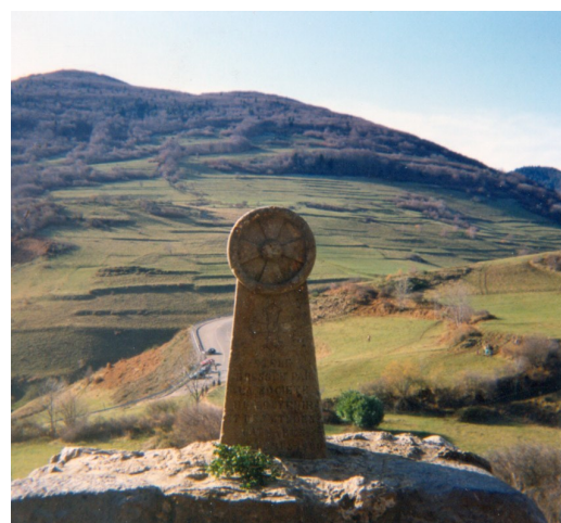
Figure 1: Stele at Montsegur commemorating the Cathars from 16 March 1244

https://upload.wikimedia.org/wikipedia/commons/7/7a/Monts%C3%A9gur_Monolit.jpg