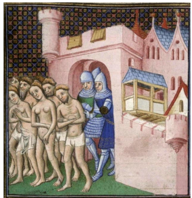
Figure 2: Expulsion of the inhabitants from Carcassonne in 1209. Image taken from Grandes Chroniques de France

https://upload.wikimedia.org/wikipedia/commons/e/e4/Cathars_expelled.JPG