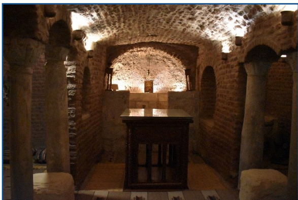
Stone shelf where Jesus slept.