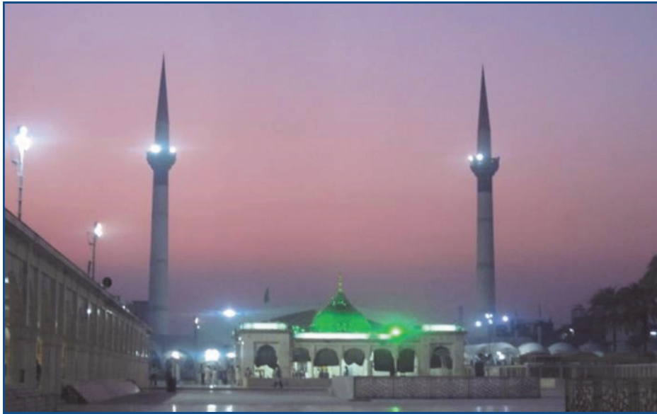
Shrine of Hazrat Data Gunj Bakhsh (Ali Hujwiri) at Night

http://wikimapia.org/9019742/Shrine-of-Hazrat-Data-Gunj-Bakhsh-Ali-Hujwiri - 6/6