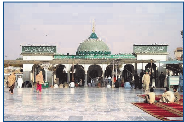
Figure 1 : Shrine of Hazrat Data Gunj Bakhsh (Ali Hujwiri)

http://wikimapia.org/9019742/Shrine-of-Hazrat-Data-Gunj-Bakhsh-Ali-Hujwiri - 4/6