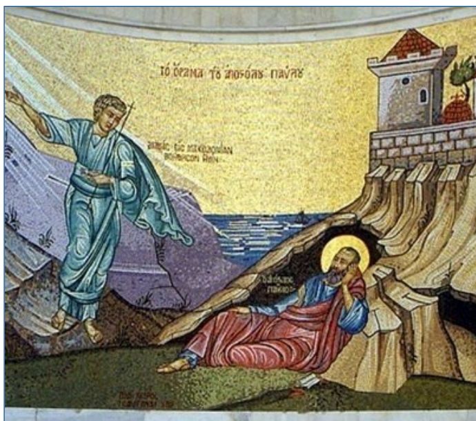
Figure 2: A man of Macedonia Appears to Paul in Troas