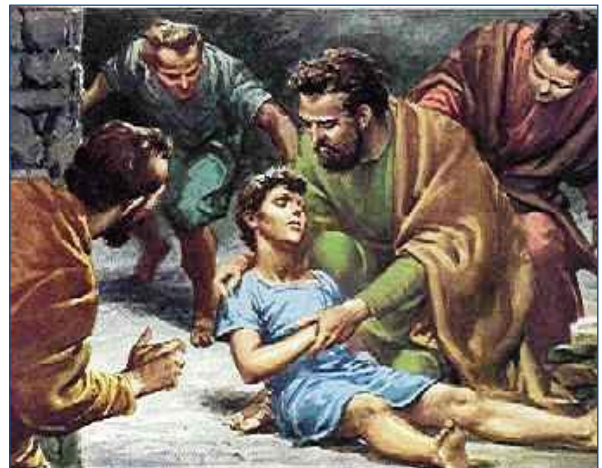
Figure 4: St. Paul raises Eutychus from the death