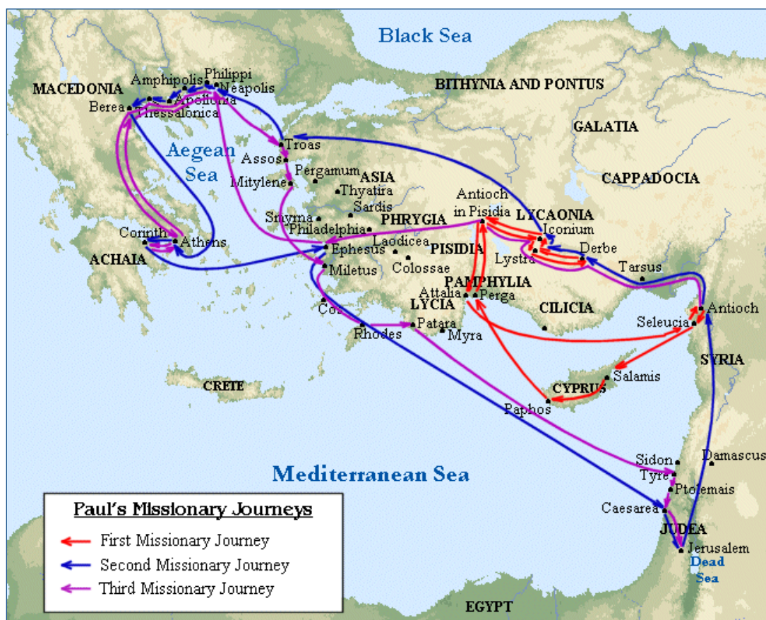
Figure 1: Apostle Paul's Missionary Journeys Map

In little more than ten years, St. Paul established the Church in four provinces of the Empire: Galatia, Macedonia, Achaia and Asia. Before AD 47, there were no churches in these provinces (Allen, 1927:3). St. Paul made two trips to Greece. The first occupied