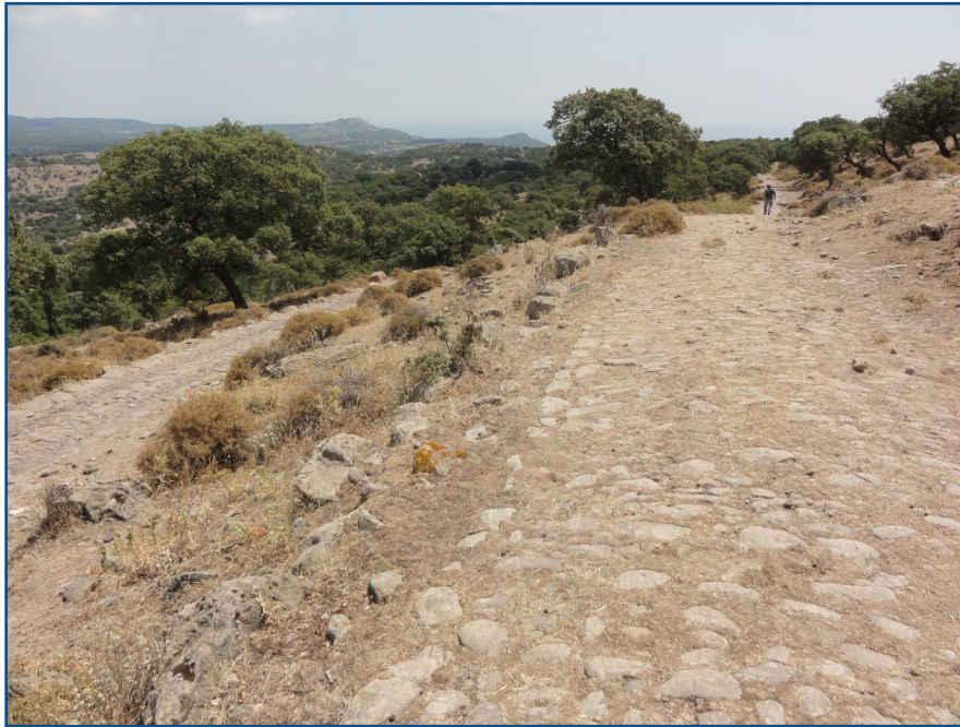
Figure 6: A portion of the well-preserved Roman Road to Assos