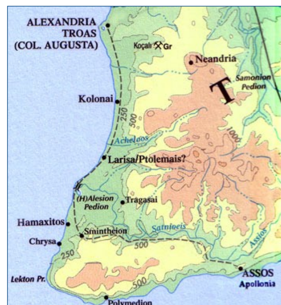
Figure 5: The St. Paul Trail in Troas