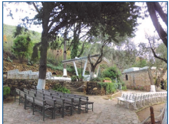
Photo 3: Worship Area Reserved for Christian Faith (Left side of Mother Mary House)

When the motivation (purpose) of Muslim visitors is compared with that of Christian visitors, it appears that Muslim visitors are in general far less conscious and informed about the history, meaning, and cultural importance of the place. Most Muslim visitors' aims related to recreational / tourism foci, instead of religious visitation. For most Muslim visitors, Mother Mary House was perceived as one of the must-see attractions around Izmir.