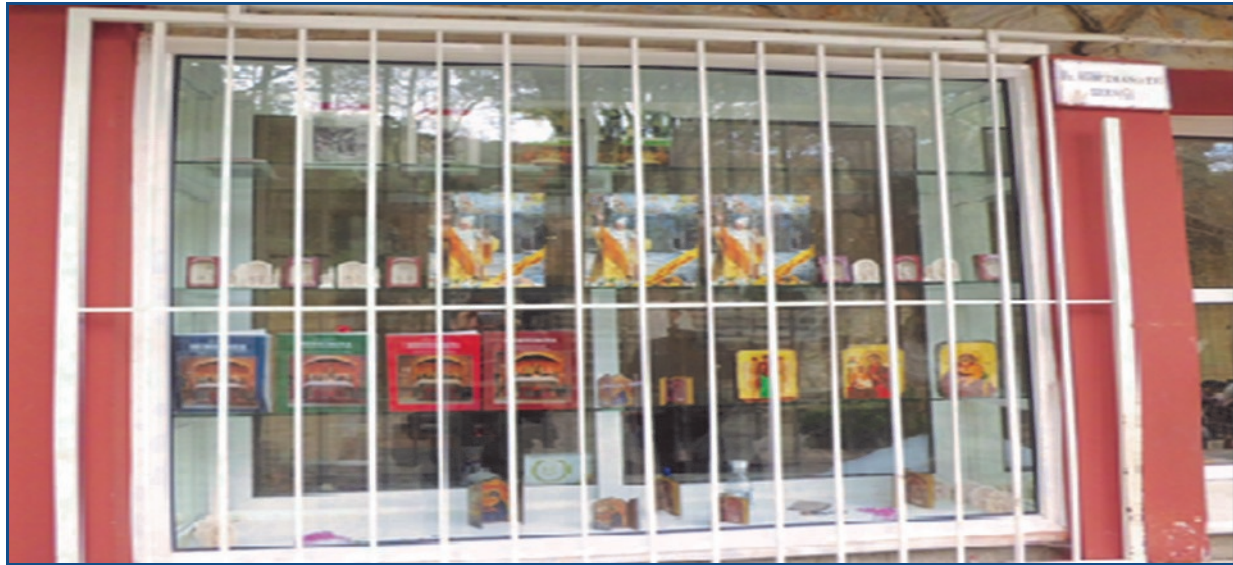
Photo 2: Bookstore selling Christian Books and Souvenirs to Visitors

It would be enriching to include books of other authors including those presenting the Islamic perspective. Regarding this as a problem, few Muslim visitors displayed awareness and even fewer of them were personally motivated to find a solution, such as writing a petition letter to improve this situation.