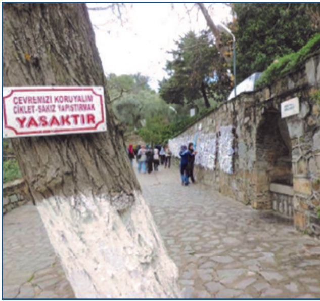
Photo 6: Warning About Chewing Gum and Environmental Pollution (Close Left) / The Holy Water Spring (Closer Right) / Wish Paper Wall (Far Right).

Alongside the Turkish visitors a significant number of foreign visitors also attach various wishes and prayers. Some ask for money, a house, marriage, love, a baby, a cure for an illness, success in approaching exams, a good job and so on.