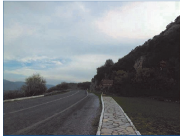
Photo 8: Transport Difficulty - Access to Mother Mary House is via a Steep Road

efforts are more meaningful and valuable in that way. However, many visitors are secular tourists and they have issues in the areas of transport problems - no pedestrian zones, no cycling lane, and a need for signposting at many points of the route (see Photo 8).