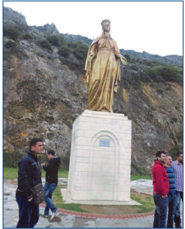
Photo 4: Facers or Gen Y youth with little Interest to Interpret Religious Heritage

education about the Mother Mary Phenomena. In this regard, Euro Turks deserve a deeper analysis since their cultural connection with their Turkish homeland can be problematic. Even if these young generations know that Jesus Christ and Mother Mary are accepted as Holy personages by Islam, their knowledge is very superficial.