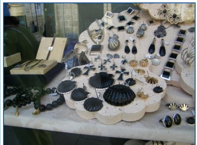
Photo 1. Jewelry showcase in Santiago de Compostela