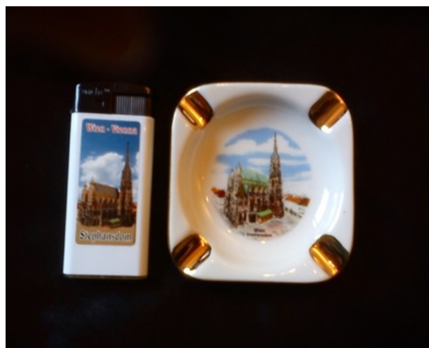
Photos 2 and 3. Pseudo-religious memorabilia from the pilgrimage to Santiago de Compostela and the Ecumenical Patriarchate of Constantinople