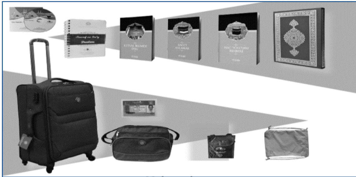
Figure 2. Books and Materials Given to Hajj Pilgrims by Presidency of Religious Affairs