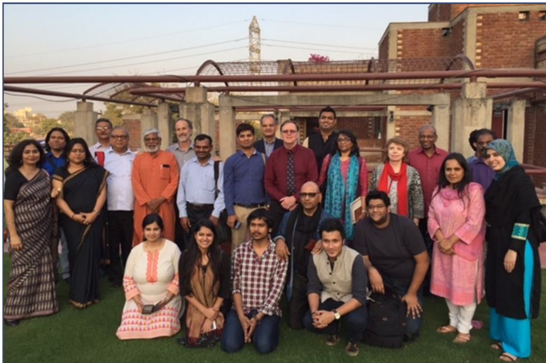
Indiana University Gateway in Gurgaon, India, March 2-3, 2016