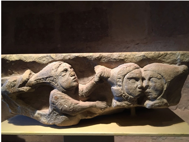
Figure 5 : Demon swallowing peasant Erfurt