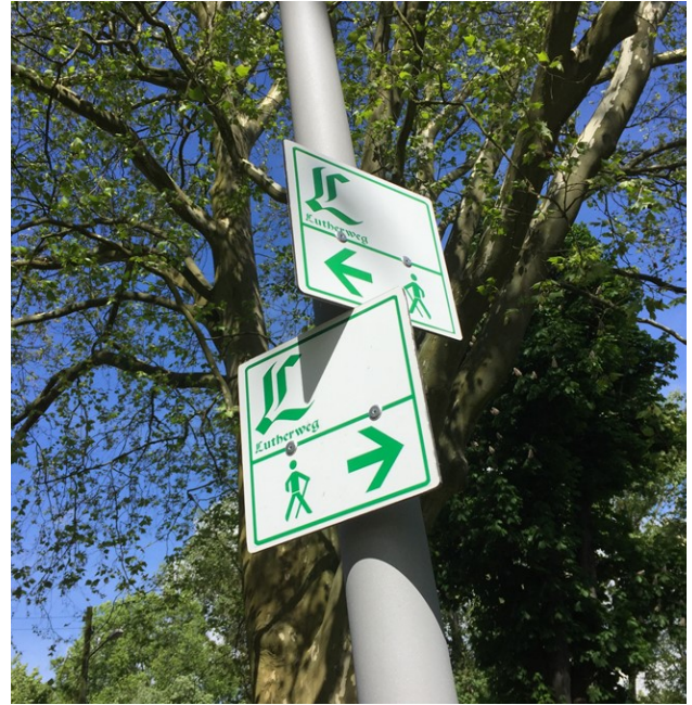
Figure 6 : Lutherweg Signs on post