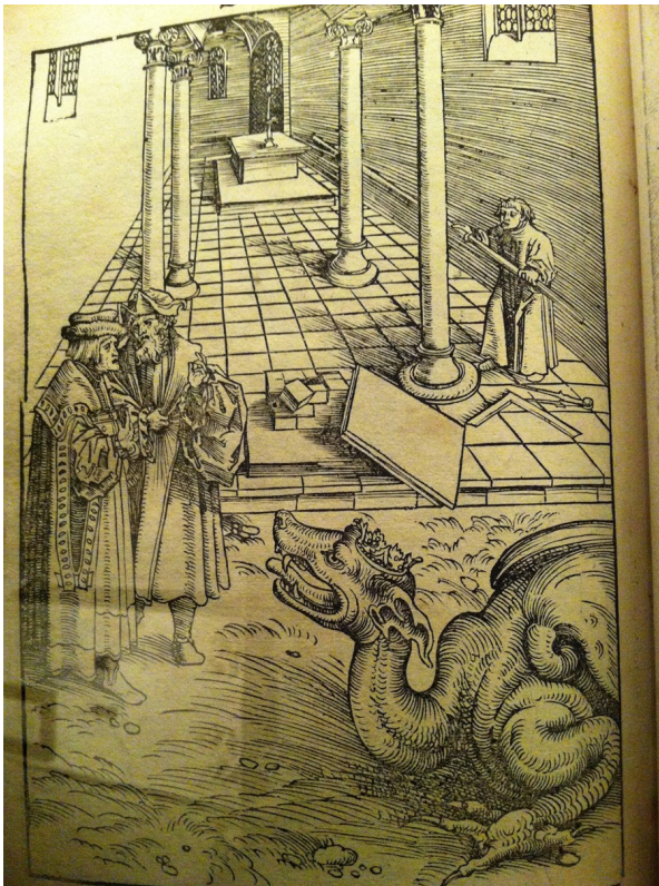
Figure 4 : Young monk Luther prepares to tame papal dragon