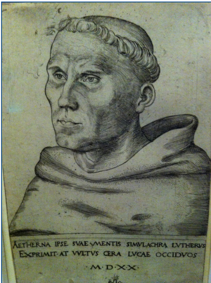
Figure 1 : Young Monk Luther

Key Words: pilgrimage, history of pilgrimage, Christian pilgrimage, Martin Luther, reformation, protestant, Lutheran, Catholicism, critique of pilgrimage, Address to the Christian Nobility of the German Nation, Smalcald Articles, shrines, merit, landscape, Romanticism, Lutherweg, 95 Theses, indulgences