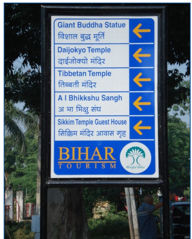
Figure 4 : New signage in Bodh Gaya promoting tourism at the various Buddhist monasteries and temples.

devotion and sacred significance. Although the motivations behind tourism and pilgrimage-related travel are not so clear-cut and often blurred in practice, one of the trends we are seeing at the various Buddhist sites in India is that this networked geography to facilitate tourist consumption may be in competition with the investment in religious architecture and organisational infrastructure by transnational Buddhist communities themselves. This is clearly evident with the rising number of Buddhist monasteries, temples and guest lodges designed to facilitate these cross-border cultural flows. In some ways this is creating a parallel system and much of the economic activity of Asian pilgrims is being absorbed by these Buddhist institutions that cater to their cultural, linguistic and spiritual needs. Through donations (or dana ) provided to the sangha and their contributions to the building of monasteries and / or temples (a significant part of accumulating merit during pilgrimage), we are seeing the consolidation of financial resources by transnational Buddhist communities and there is some concern by municipal authorities that these funds are not being reinvested at the local level (see Figure 4 and Figure 5).