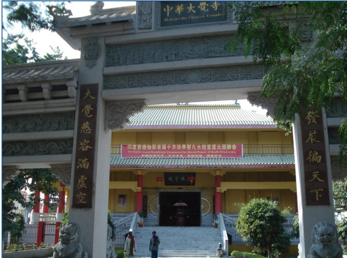
Figure 5 : The Mahabodhi Chinese Monastery in Bodh Gaya.