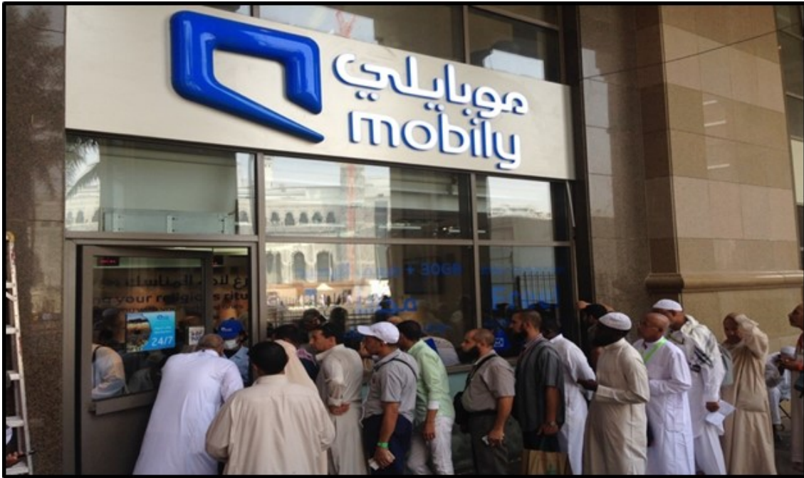
Figure 1: Pilgrims are busy in buying Smartphones and SIM cards in Makkah