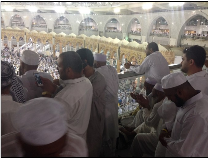
Figure 2: Pilgrims using SMT during the Hajj