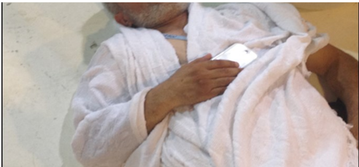
Figure 3: Pilgrim sleeping with his smartphone

In particular, many referred to what was observed during the research; that is the widespread and constant